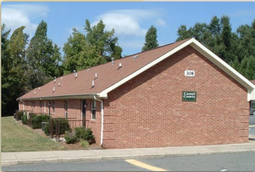
Camel Courts 306-312 W. Camel Street Greensboro, North Carolina 27401