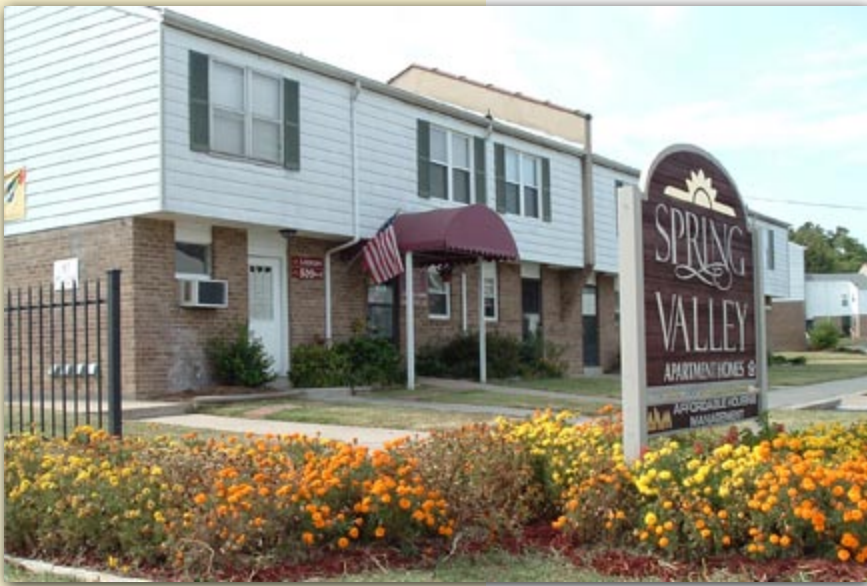
Spring Valley Apartments 509 E. Commerce Avenue High Point, North Carolina 27260