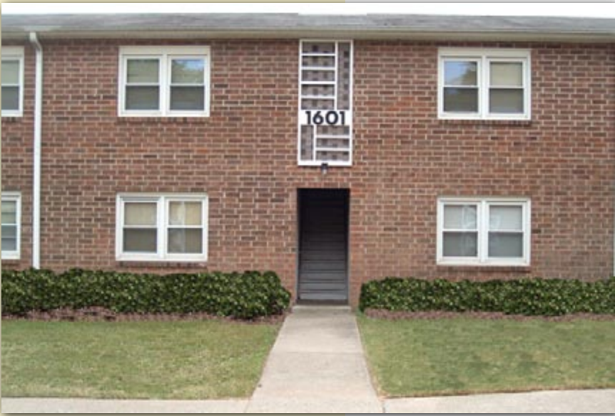
Autumn Drive Apartments 1601 Autumn Drive Greensboro, North Carolina 27401