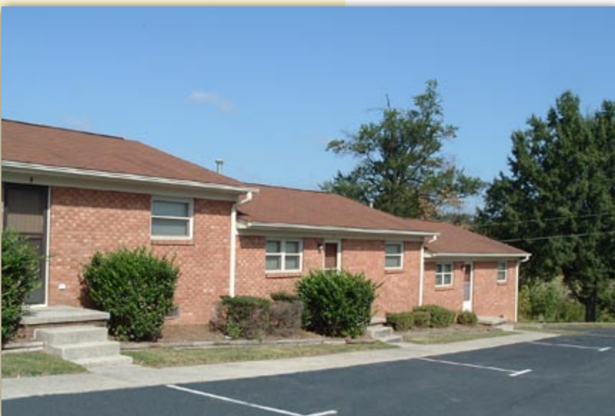
Spencer Street Apartments 2101 & 2103 Spencer Street Greensboro, North Carolina 27401