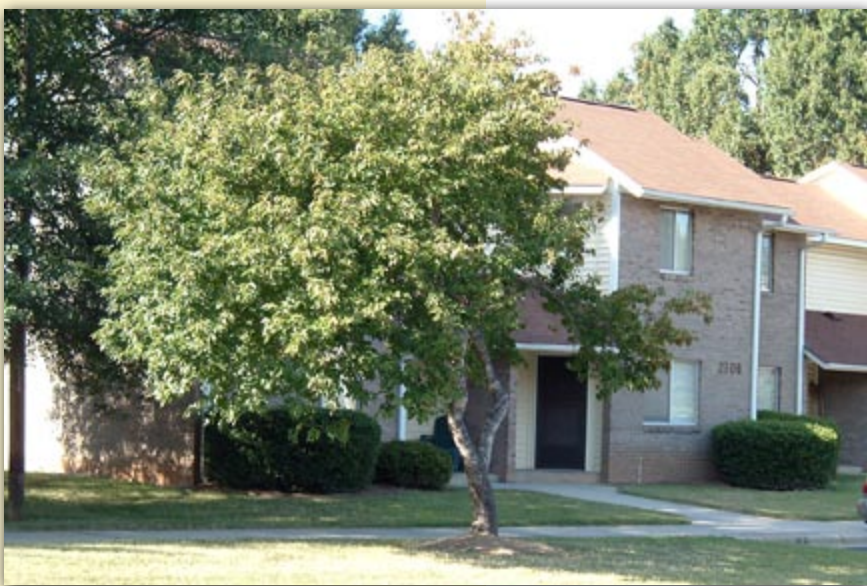
Laurence Manor 2300 Juliet Place Greensboro, North Carolina 27406