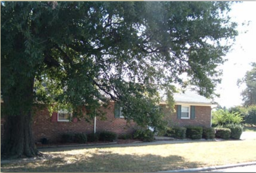
Bingham/English Street Apartments 225 Bingham Street 316 English Street Greensboro, North Carolina 27401