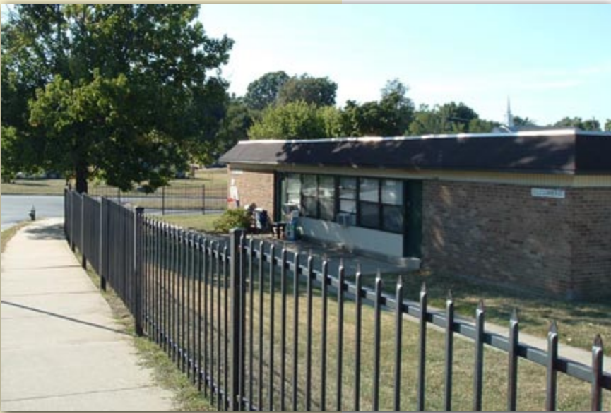
Parkside Apartments 306-A O'Conner Street Greensboro, North Carolina 27406