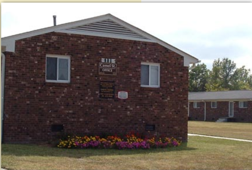
Camel Street Apartments 315 W. Camel Street Greensboro, North Carolina 27401