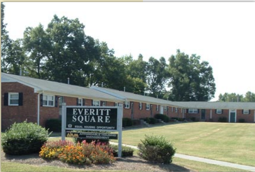
Everitt Square 2130 Everitt Street Greensboro, North Carolina 27401