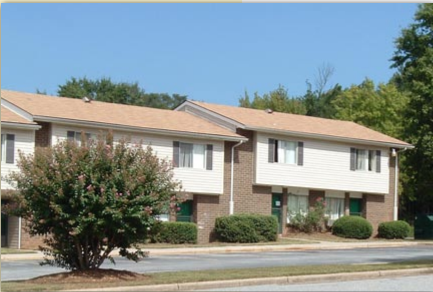
Woodview Apartments 1016 Georgia Avenue Eden, North Carolina 27288