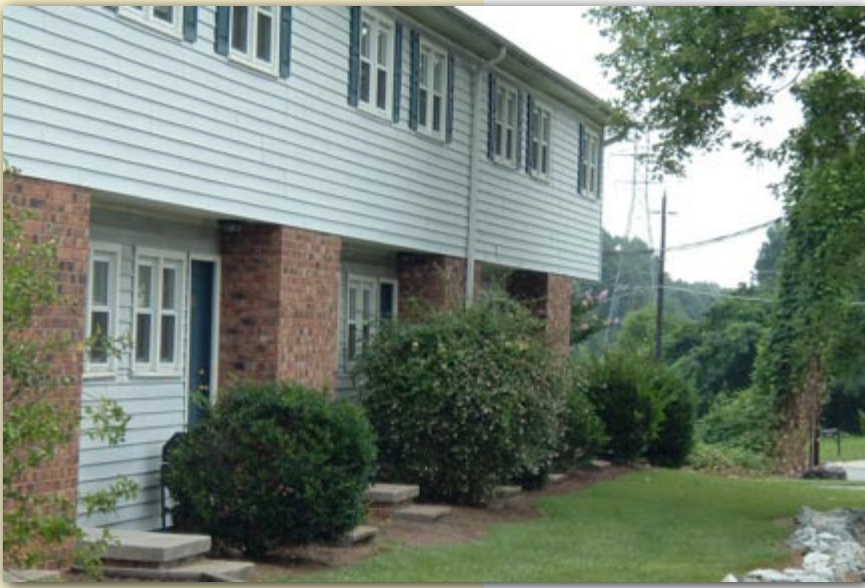
Berryman Square 200-208 Berryman Street Greensboro, North Carolina 27405