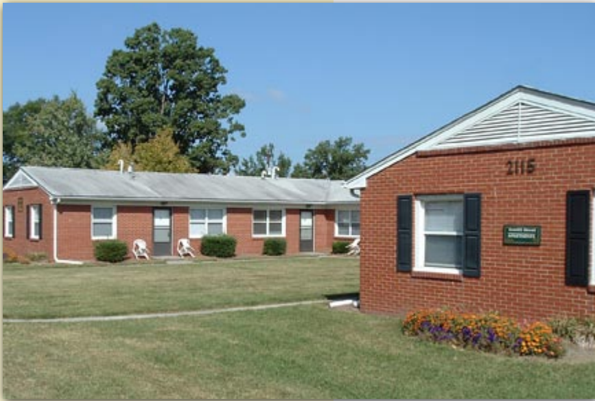
Everitt Street Apartments 2115, 2116, 2118 Everitt Street Greensboro, North Carolina 27401