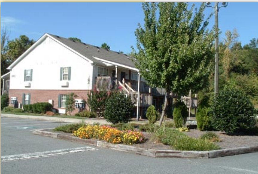
Southwoods 2307 Columbus Street Greensboro, North Carolina 27506