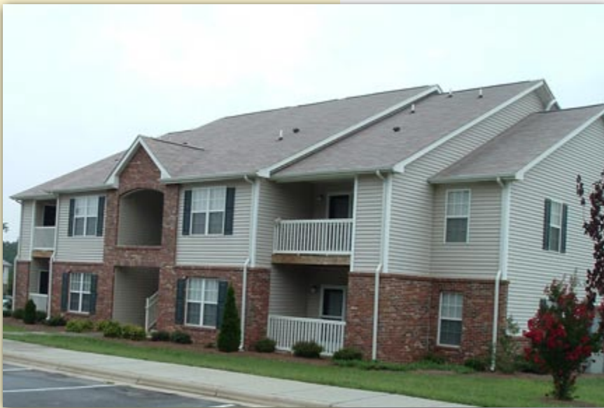
Windhill 201 Windhill Court Greensboro, North Carolina 27405